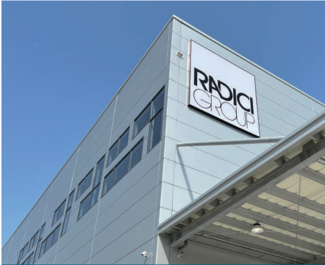
DSR-J for RADICI GROUP