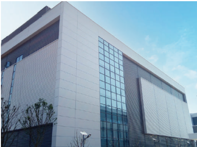
DSR-J for China Mobile Data Center