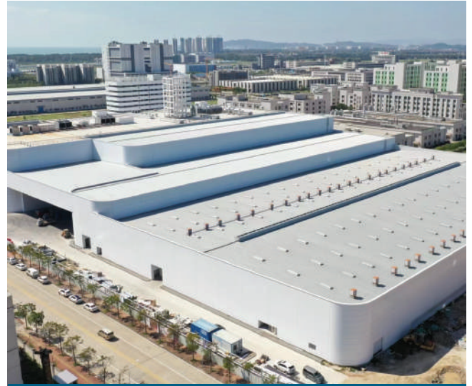
DSR-J for Yinglian Metallic