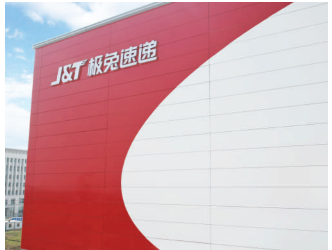
DSR-J for J&T Baoying Logistics project